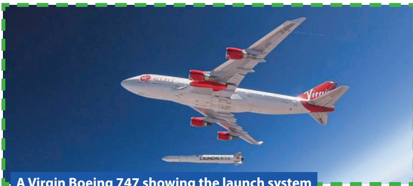
A Virgin Boeing 747 showing the launch system for RAF Project Artemis

The RAF Artemis team will collaborate to build, launch, and operate a series of satellites - all from the UK.